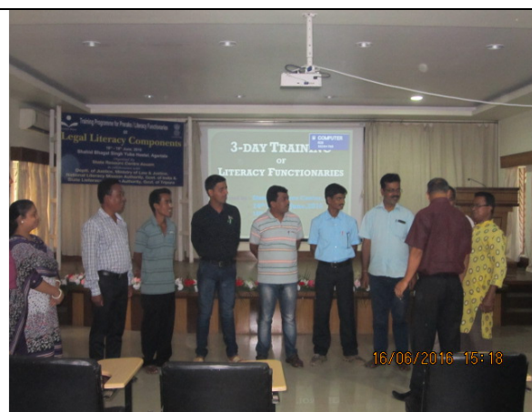
Participants are looking during training game