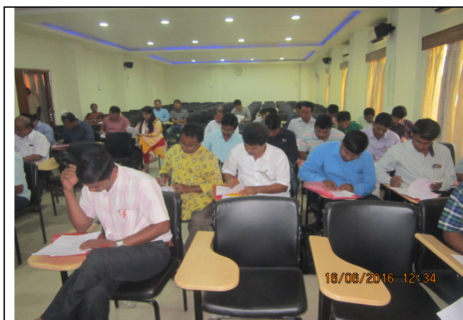
Participants are looking busy during Pre test session