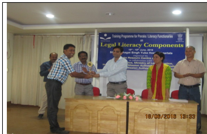
Distribution of Prize to the highest marks scorer in Post Test