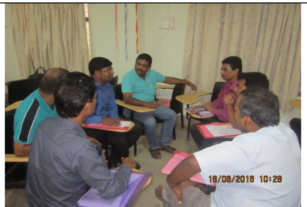
Participants are busy in a group work