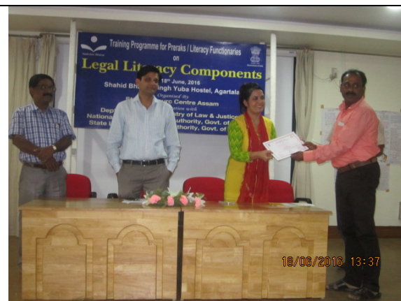
Distribution of Certificates to the participants